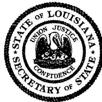
Secretary of State 35671349K