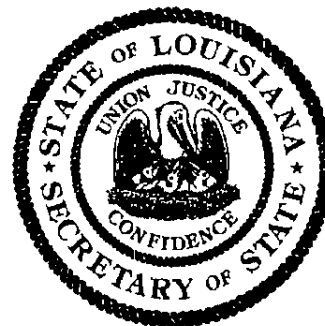
Secretary of State 36348562K