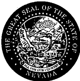
ROSS MILLER Secretary of State

Electronic Certificate Certificate Number: C20070328-3060 You may verify this electronic certificate online at http://secretaryofstate.biz/