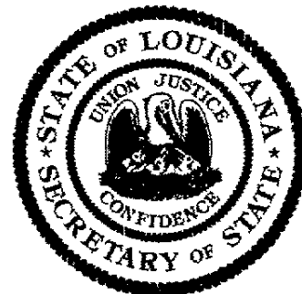
Secretary of State 36214598K