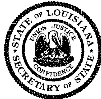
Secretary of State 36067231K