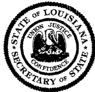
Secretary of State 36354467K