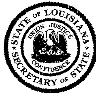
Secretary of State 36354467K