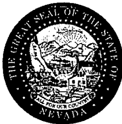
DEAN HELLER Secretary of State

Electronic Certificate Certificate Number: C20061116-0265 You may verify this electronic certificate online at http://secretaryofstate.biz/