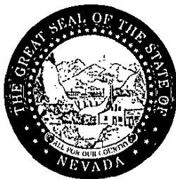
DEAN HELLER Secretary of State

Electronic Certificate Certificate Number: C20061023-1934 You may verify this electronic certificate online at http://secretaryofstate.biz/