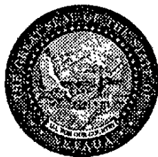
DEAN HELLER Secretary of State

Electronic Certificate Certificate Number: C20061003-0836 You may verify this electronic certificate online at http://secretaryofstate.biz/