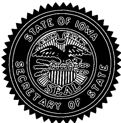
CHESTER J. CULVER SECRETARY OF STATE

I, CHESTER J. CULVER, Secretary of State of the State of Iowa, custodian of the records of limited liability companies, certify that the limited liability company named on this certificate was duly organized under the laws of Iowa on the date printed above, that all fees required by the Iowa Limited Liability Company Act have been paid, and that articles of dissolution have not been filed.