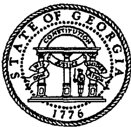
Karen C Handel Secretary of State

WITNESS my hand and official seal in the City of Atlanta and the State of Georgia on February 20, 2008