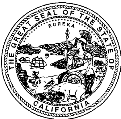
BRUCE McPHERSON Secretary of State

IN WITNESS WHEREOF, I execute this certificate and affix the Great Seal of the State of California this day of April 13, 2006.