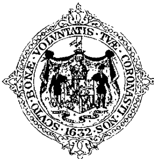
Paul B. Anderson Charter Division

301 West Preston Street, Baltimore, Maryland 21201 Telephone Balto. Metro (410) 767-1340 / Outside Balto. Metro (888) 246-5941 MRS (Maryland Relay Service) (800) 735-2258 TT/Voice Fax (410) 333-7097