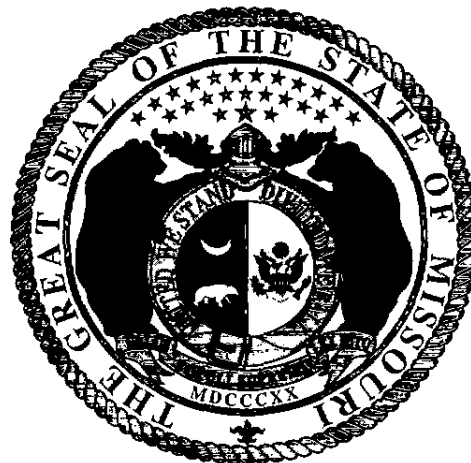
Secretary of State

Certification Number: 8015158-1 Reference: Verify this certificate online at http://www.sos.mo.gov/businessentity/verification