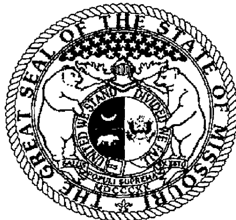
Secretary of State