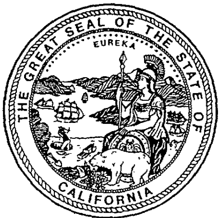
BRUCE McPHERSON Secretary of State

IN WITNESS WHEREOF, I execute this certificate and affix the Great Seal of the State of California this day of April 30, 2005.