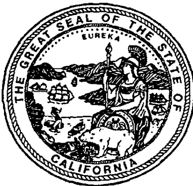
BRUCE McPHERSON Secretary of State

IN WITNESS WHEREOF, I execute this certificate and affix the Great Seal of the State of California this day of April 5, 2005.