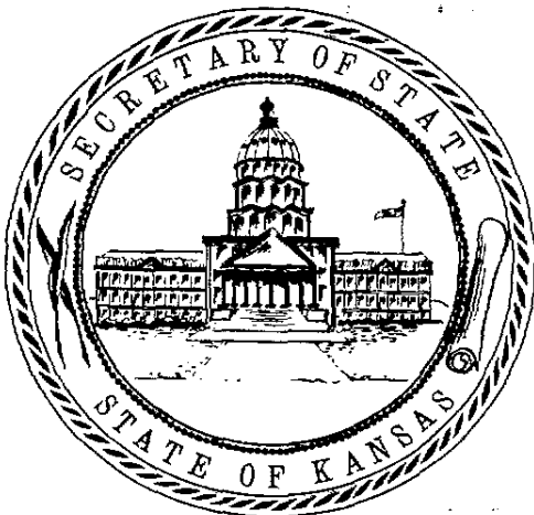
RON THORNBURGH SECRETARY OF STATE

Done at the City of Topeka, this 12th day of April, A.D. 2004