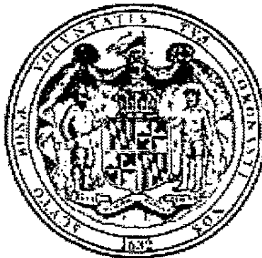
Paul B. Anderson Charter Division

301 West Preston Street, Baltimore, Maryland 21201 Telephone Balto. Metro (410) 767-1340 / Outside Balto. Metro (888) 246-5941 MRS (Maryland Relay Service) (800) 735-2258 TT/Voice Fax (410) 333-7097