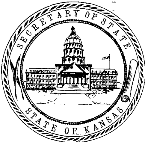
RON THORNBURGH SECRETARY OF STATE

In testimony whereof: I hereto set my hand and cause to be affixed my official seal. Done at the City of Topeka, this 2nd day of January, A.D. 2003