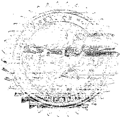
BILL JONES Secretary of State