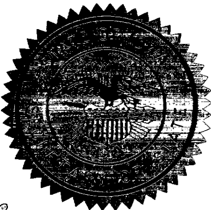
CHESTER J. CULVER SECRETARY OF STATE

FILED 01 APR -4 PM 1:48 SECRETARY OF STATE TALENT HASSE FLORENDA