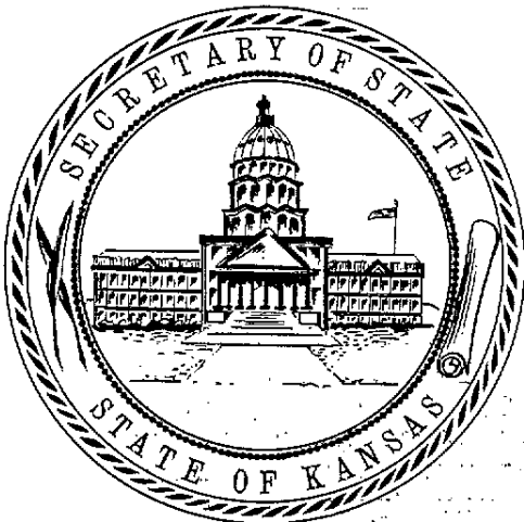
RON THORNBURGH SECRETARY OF STATE

Done at the City of Topeka, this 30th day of October, A.D. 2000