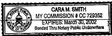
Signature of Notary Public

Notary Commission Expiration Date (if not perpetual authority)