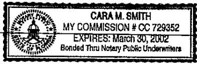
_____ Notary Expiration Date (if not perpetual authority)