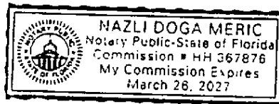
Exhibit-1: Articles of Dissolution of AM-BRANCHES HOLDINGS, L.L.C