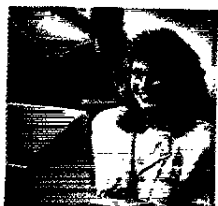
PROFESSIONAL CALL CENTER

Enclosed please find the amended articles of organization for Consumer Sales Solutions, LLC a Florida limited liability company. I have also enclosed the $25.00 filing fee, $30 for the Certified copy and $5.00 for a Certificate of Status.