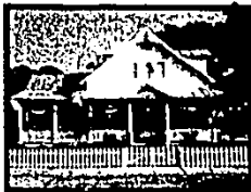
Located in the Historic Captain H. B. Jeffries Home

38537 FIFTH AVENUE ZEPHYRHILLS, FL 33540