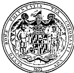
Paul B. Anderson Charter Division