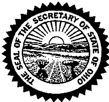
J. Kenneth Blackwell Secretary of State

WITNESS my hand and official seal at Columbus, Ohio on October 26, 1999