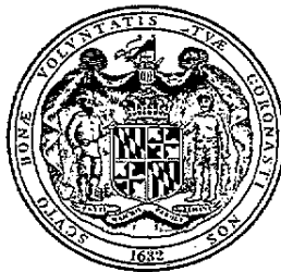
Paul B. Anderson Charter Division

301 West Preston Street, Baltimore, Maryland 21201 Telephone Balto. Metro (410) 767-1340 / Outside Balto. Metro (888) 246-5941 0000275764 MRS (Maryland Relay Service) (800) 735-2258 TT/Voice Fax (410) 333-7097