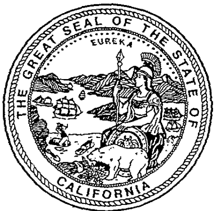
BRUCE McPHERSON Secretary of State

IN WITNESS WHEREOF , I execute this certificate and affix the Great Seal of the State of California this day of October 27, 2005.