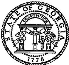
Cathy Cox Secretary of State