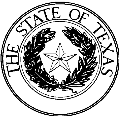
Alberto R. Gonzales Secretary of State

IN TESTIMONY WHEREOF, I have hereunto signed my name officially and caused to be impressed hereon the Seal of State at my office in the City of Austin, on November 23, 1998.