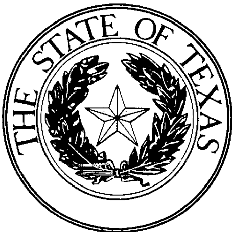
Alberto R. Gonzales Secretary of State

IN TESTIMONY WHEREOF, I have hereunto signed my name officially and caused to be impressed hereon the Seal of State at my office in the City of Austin, on August 31, 1998.