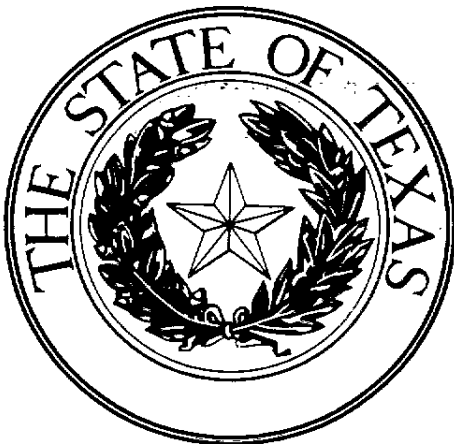
Alberto R. Gonzales Secretary of State

IN TESTIMONY WHEREOF, I have hereunto signed my name officially and caused to be impressed hereon the Seal of State at my office in the City of Austin, on May 29, 1998.