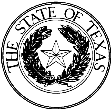
Alberto R. Gonzales Secretary of State

IN TESTIMONY WHEREOF, I have hereunto signed my name officially and caused to be impressed hereon the Seal of State at my office in the City of Austin, on April 7, 1998.