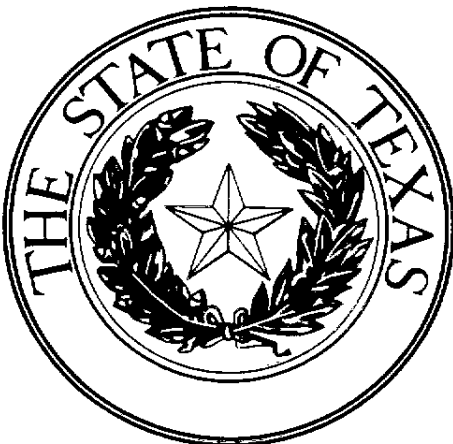
Alberto R. Gonzales Secretary of State

IN TESTIMONY WHEREOF, I have hereunto signed my name officially and caused to be impressed hereon the Seal of State at my office in the City of Austin, on April 3, 1998.