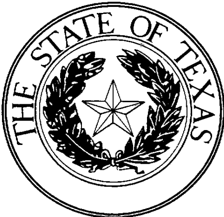
Alberto R. Gonzales Secretary of State

IN TESTIMONY WHEREOF, I have hereunto signed my name officially and caused to be impressed hereon the Seal of State at my office in the City of Austin, on March 16, 1998.