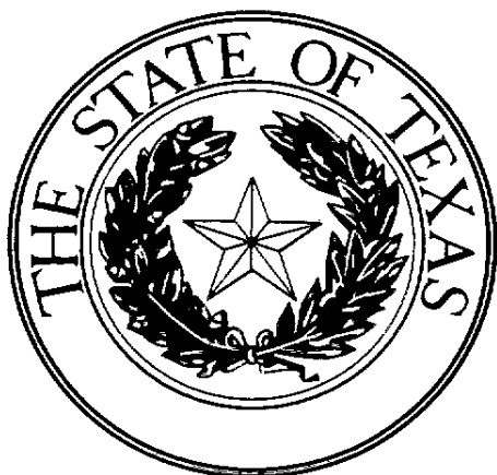
Alberto R. Gonzales Secretary of State

IN TESTIMONY WHEREOF, I have hereunto signed my name officially and caused to be impressed hereon the Seal of State at my office in the City of Austin, on December 23, 1997.