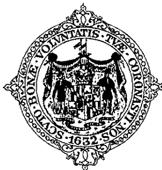
Paul B. Anderson Charter Division