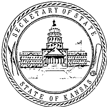
RON THORNBURGH SECRETARY OF STATE

In testimony whereof: I hereto set my hand and cause to be affixed my official seal. Done at the City of Topeka, this 11th day of December, A.D. 1995