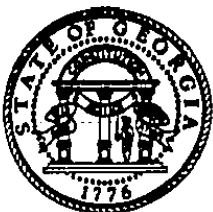
MAX CLELAND SECRETARY OF STATE