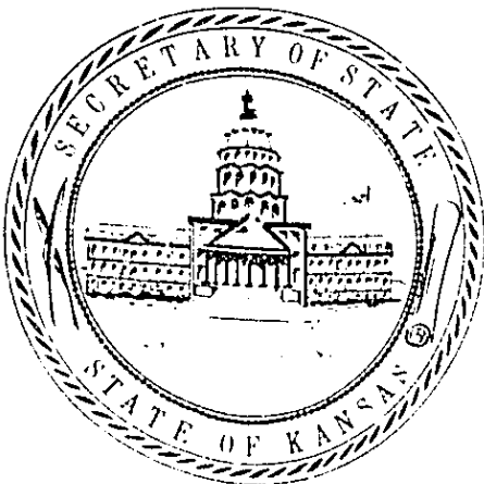
RON THORNBURGH SECRETARY OF STATE

In testimony whereof: I hereto set my hand and cause to be affixed my official seal. Done at the City of Topeka, this 25th day of September, A.D. 1995