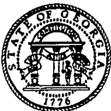
MAX CLELAND SECRETARY OF STATE