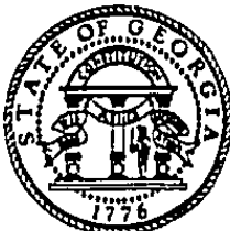
MAX CLELAND SECRETARY OF STATE