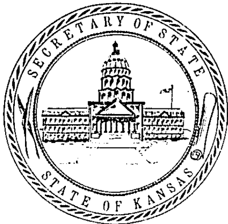
RON THORNBURGH SECRETARY OF STATE

In testimony whereof: I hereto set my hand and cause to be affixed my official seal. Done at the City of Topeka, this 10th day of July, A.D. 1995