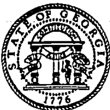
MAX CLELAND SECRETARY OF STATE