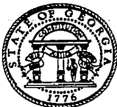
MAX CLELAND SECRETARY OF STATE