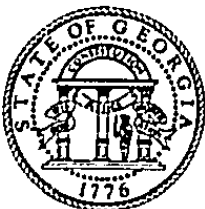
MAX CLELAND SECRETARY OF STATE